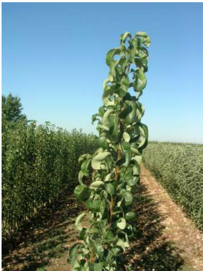
Plançó de perera